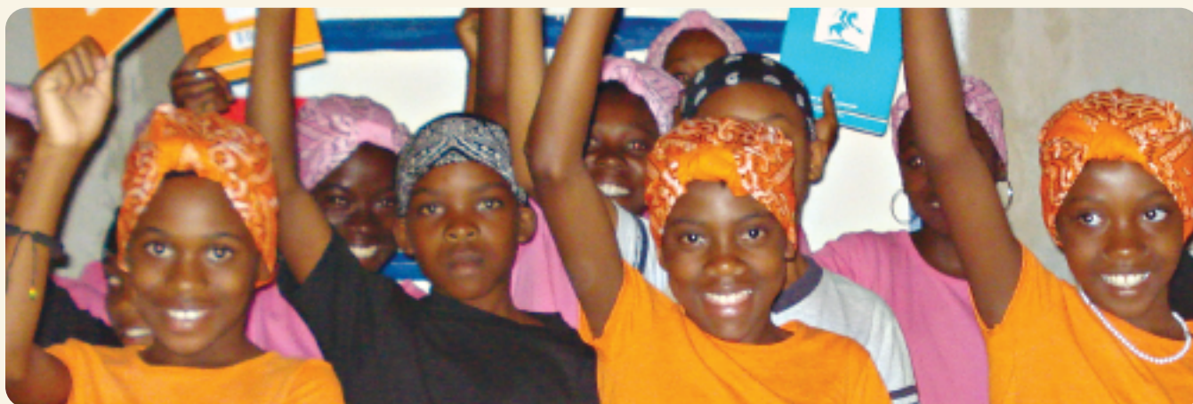
Kids in a children's choir started by Haiti Partners are getting educational experiences, building their self-confidence, and singing for churches and groups around Port-au-Prince.

If you have any questions, please email ( mail@beyondborders.net ) or call us (866-424-8403). For more information about our new sister organization, visit www.HaitiPartners.org .