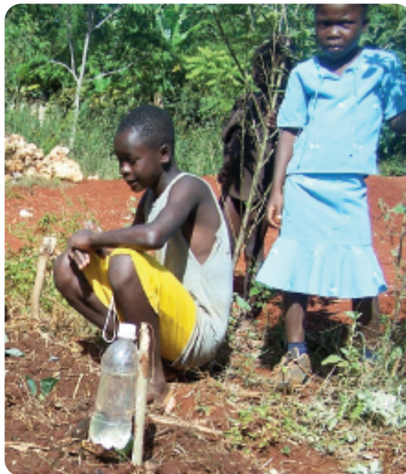
After the devastating hurricanes and storms in Haiti last year, your generosity helped 30 communities we work with by contributing to their recovery, including the seed these two children are planting in their church garden.