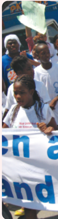
Haitians march in Port-au-Prince (last year) to protest the practice of child servitude and their active role in protecting children.

This year... an additional 1,300 families will be integrated into our mapping and survey program. We will complete the beta version of a child and family welfare database to capture and manage information from surveys and casework. Then we can evaluate the effectiveness of our efforts to stop the flow of children into servitude, reunite children with their families, and protect children separated from their families. We'll continue supporting the growth of networks and coalitions working to stop child slavery. An additional 1,200 leaders will participate in our child rights training program. We'll initiate a new program to train groups of peer social workers who will help vulnerable families keep